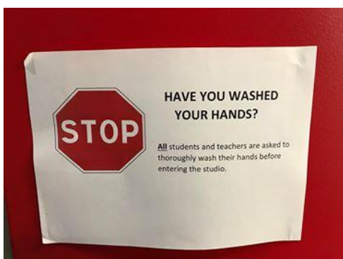
KHSD COVID-SAFE PLAN

Please carefully read our Covid-Safe Plan , as it is applicable to every student, parent, teacher and staff member. We need the support and compliance of all to keep The Oak open and a safe place for everyone.